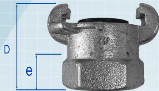
BSP Female A-Claw